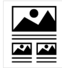
Full 2 Column

Create your content, adding images, text and other style options. You may enter a TAG for any template - this is useful when filtering templates at the time you create new messages.